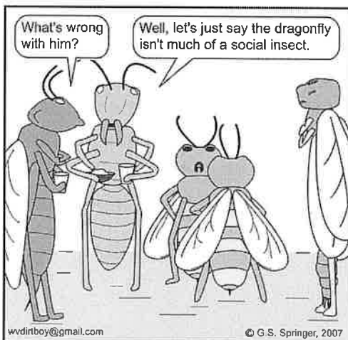
At An Insect Party

Literature: For poetry this month, we will be reading the story, Peter Pan by J. M. Barrie.